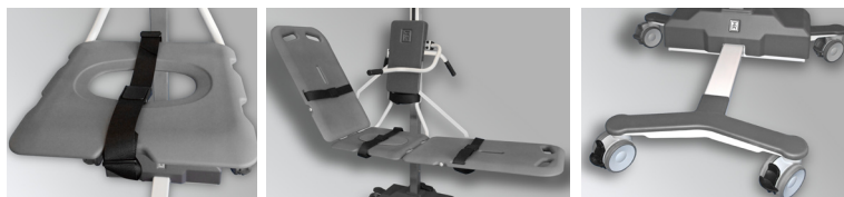
Commode seat on chair which can be covered by included lid.