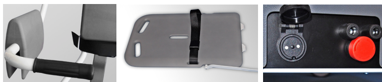
Comfortable back rest that can easily be moved to either arms for back support.